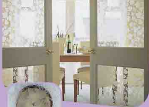
Pilkington Oriel Coppice™